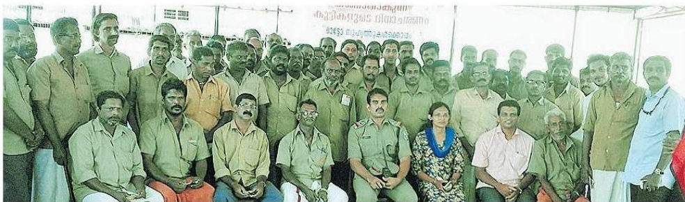
ചൈൽഡ് ലൈൻ, പൊലീസ്, ചേർന്ന് നടത്തിയ പരിശീലന പരിപാടിയിൽ പങ്കെടുത്ത ഓട്ടോ ഡ്രൈവർമാർ